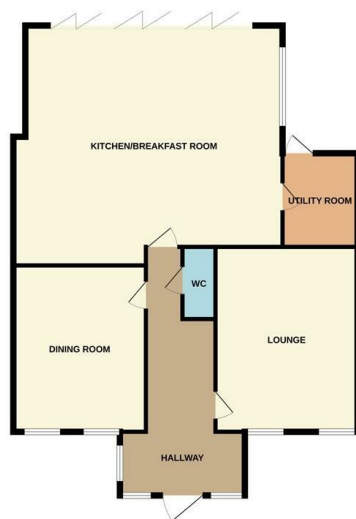
GROUND FLOOR 1172 sq.ft. (108.9 sq.m.) approx.