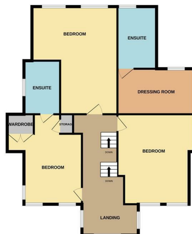
1ST FLOOR 1200 sq.ft. (111.5 sq.m.) approx.